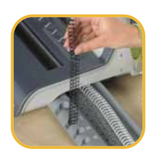
Patented wire & document measure allows user to select quickly