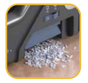
Chip tray with burst out feature to eliminate jams