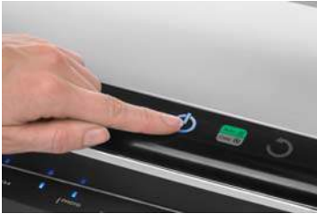
Touch panel power button

Fully automatic Laminator with InstaHeat