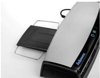
Back tray to support the laminated document